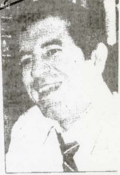
NICK JOE RAHALL Democratic Incumbent